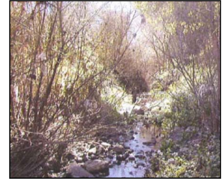
Top Left: Looking west across the project site; Top Right: The short-eared owl; Bottom Left: Chumash tule reed houses; Bottom Right: Main stem of the Nipomo Creek, on the project site.